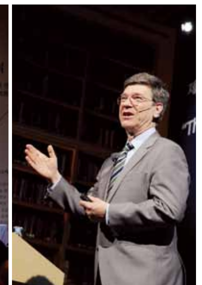
Special Lecture by Prof. Jeffrey D. Sachs