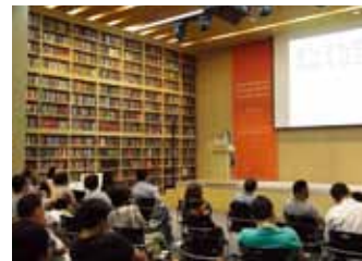
Korean Language Presentation