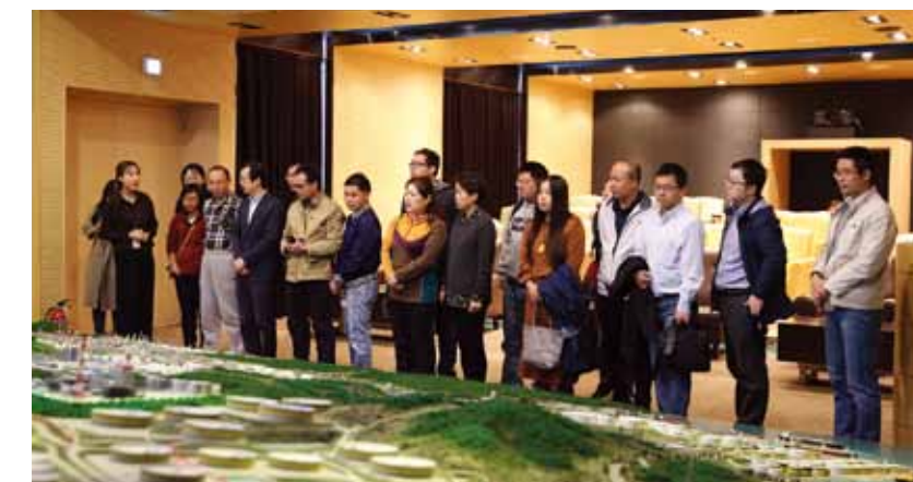
SK Energy Ulsan Complex Visit