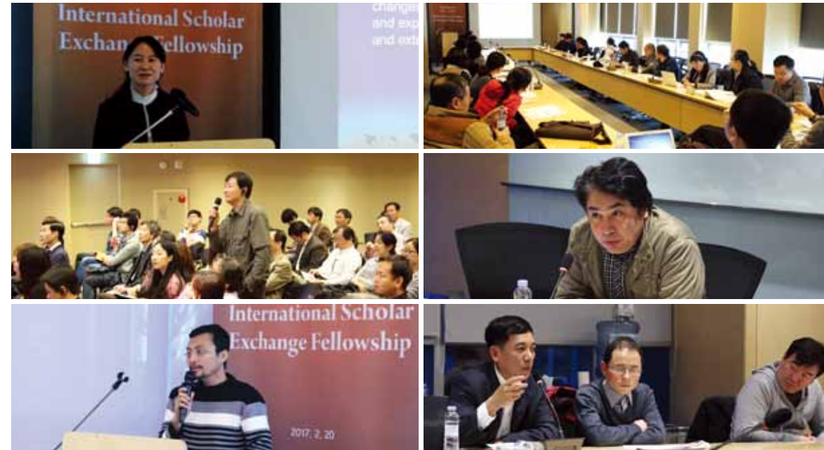
Academic seminars by ISEF fellows

dations. You may download the form at the KFAS homepage. (“Community”→“Download”→“Letter of Recommendation.doc”)