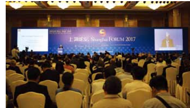
2017 Shanghai Forum

Forum with the Asia Media Research Center of Communication University of China to discuss the latest research in the fields of journalism, communication, media, new technologies, digital content, and related policies.