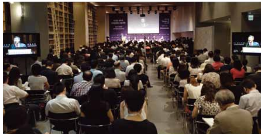
KFAS Conference Hall