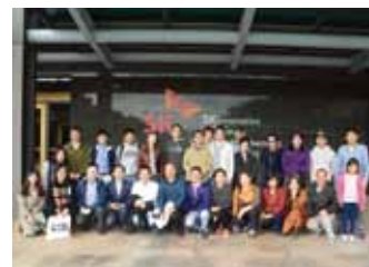
Visit to Industrial Site