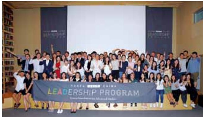
Korea-China LEADership Program