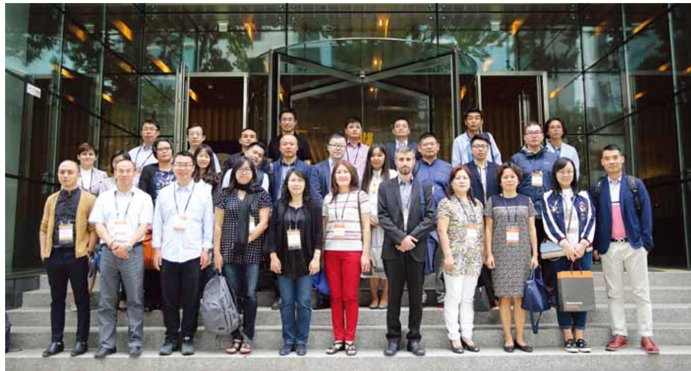
Arrival of 2017-2018 ISEF Fellows, in front of KFAS headquarters.

The ISEF program provides outstanding scholars with comprehensive research expenses during their stay in Korea, which include round-trip airfare, initial settlement support, a monthly research stipend, research paper publication support, and accident insurance. During their stay in Korea, fellows enjoy full access to KFAS facilities including the seminar rooms and library to help their research.