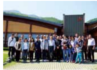
Visit to Afforestation Plant