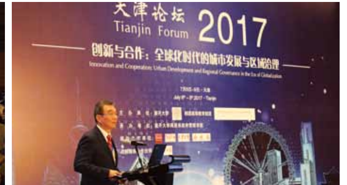
2017 Tianjin Forum