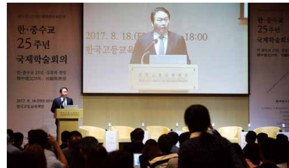
International Conference Commemoration 25 Years of Korea-China Diplomatic Relations