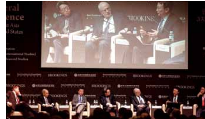
China-US-ROK Trilateral Conference