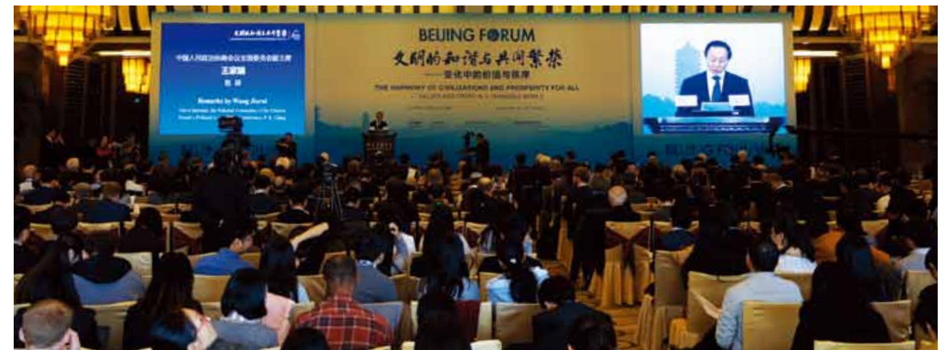
2017 Beijing Forum

KFAS and Renmin University of China have agreed to host the International Forum on Confucianism and the Law Forum biennially from 2015 onwards and the first Law Forum celebrating the 800th anniversary of the Magna Carta was held on September 5 to 6, 2015, at Renmin University under the overarching theme, “the Past, Present and Future of the Rule of Law.” The International Forum on Confucianism was held on December 2 to 3, 2016 under the theme, “Family, State, and Kingdom in the Horizon of Confucianism”, followed by the Law Forum on “Culture, the Rule of Law and Social Development” on November 18 to 19, 2017.