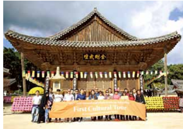
First Cultural Tour for 2017-2018 ISEF Fellows

University of Tehran Asia Research Center P.O. Box 11155-4563, 14174, Tehran, Iran T. 98-21-61112185 E. arc@ut.ac.ir