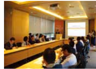
Orientation for the ISEF Fellows