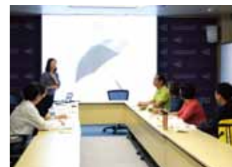
Korean Language Class