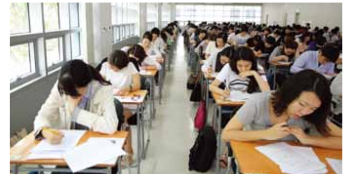
Scholarship Program Exam

Korea Foundation for Advanced Studies (KFAS) is an independent non-profit organization founded in 1974. KFAS is dedicated to promoting academic development and social progress by funding exceptional students to earn their doctoral degrees overseas at world-renowned universities. In addition, KFAS has created additional programs to expand our academic network and create academic opportunities for the public. KFAS's programs are as follows: