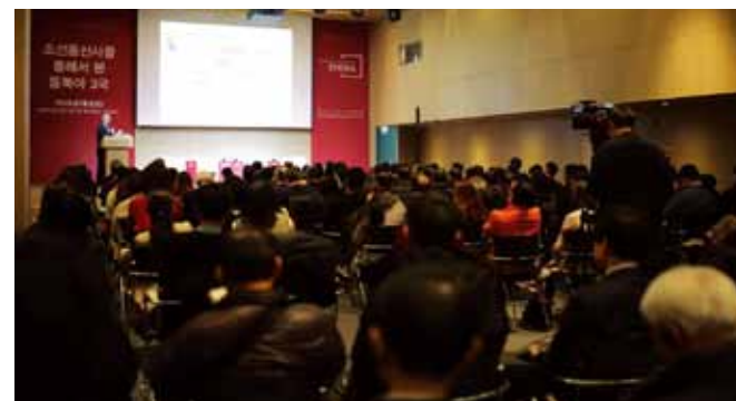
China Lecture Series